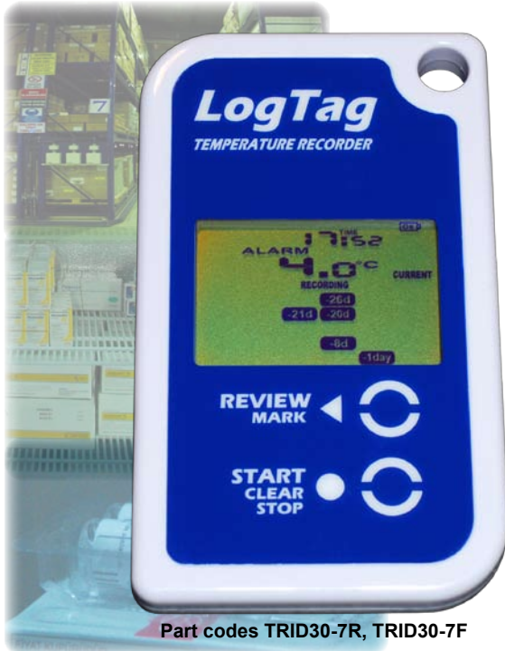
Part codes TRID30-7R, TRID30-7F

The LogTag TRID30-7 temperature recorder features a display together with a data logging function storing up to 7770 temperature readings. Statistical temperature and duration readings for up to 30 days can be reviewed on the display.